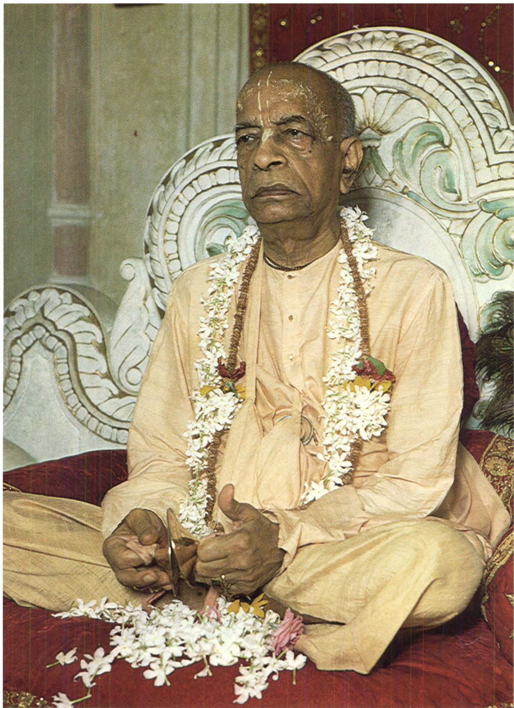
His Divine Grace A. C. Bhaktivedanta Swami Prabhupāda Founder-Ācārya of the International Society for Krishna Consciousness