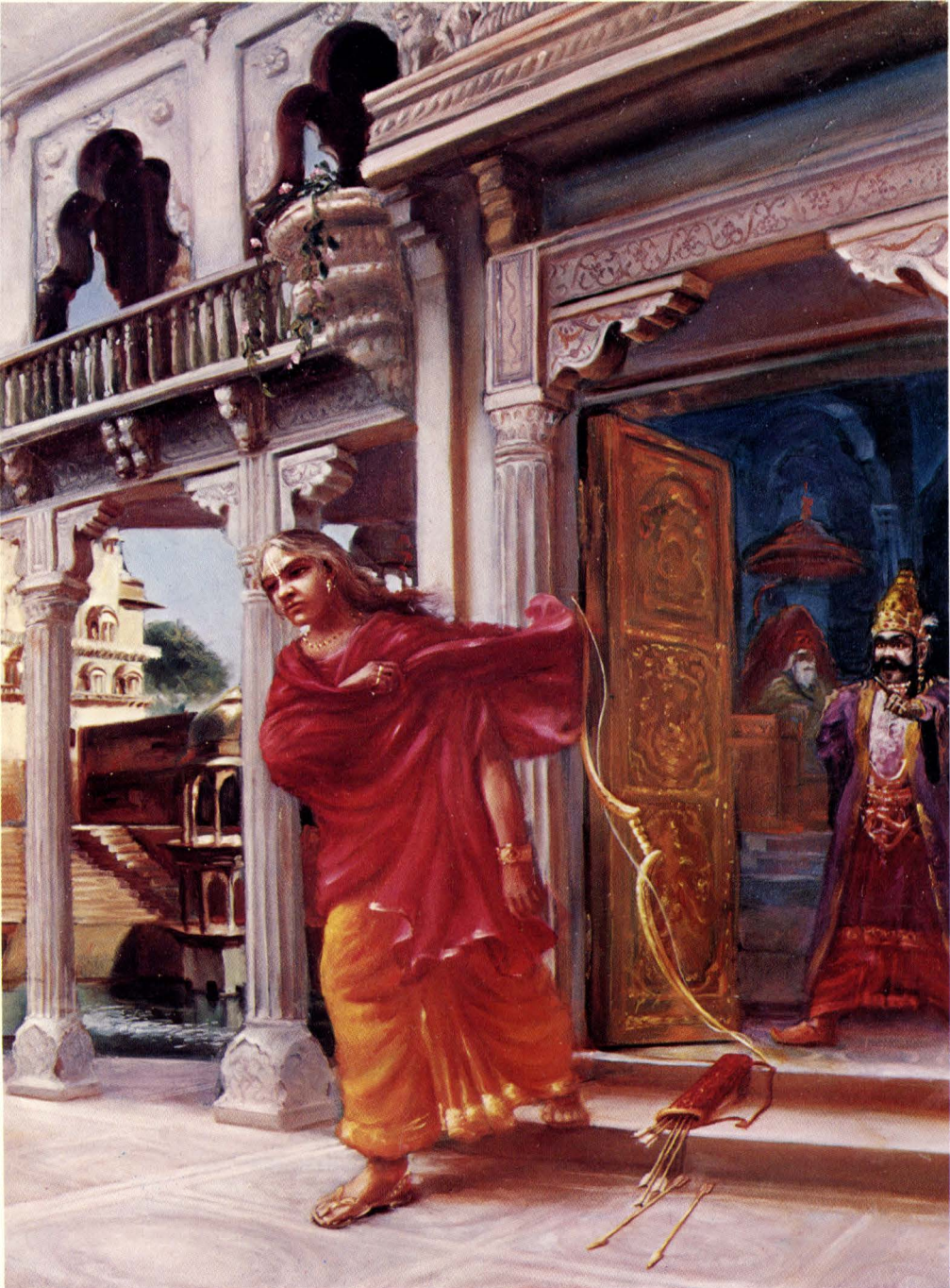
Plate 1 Vidura placed his bow at the door and quit his brother's palace for good. (p. 15)