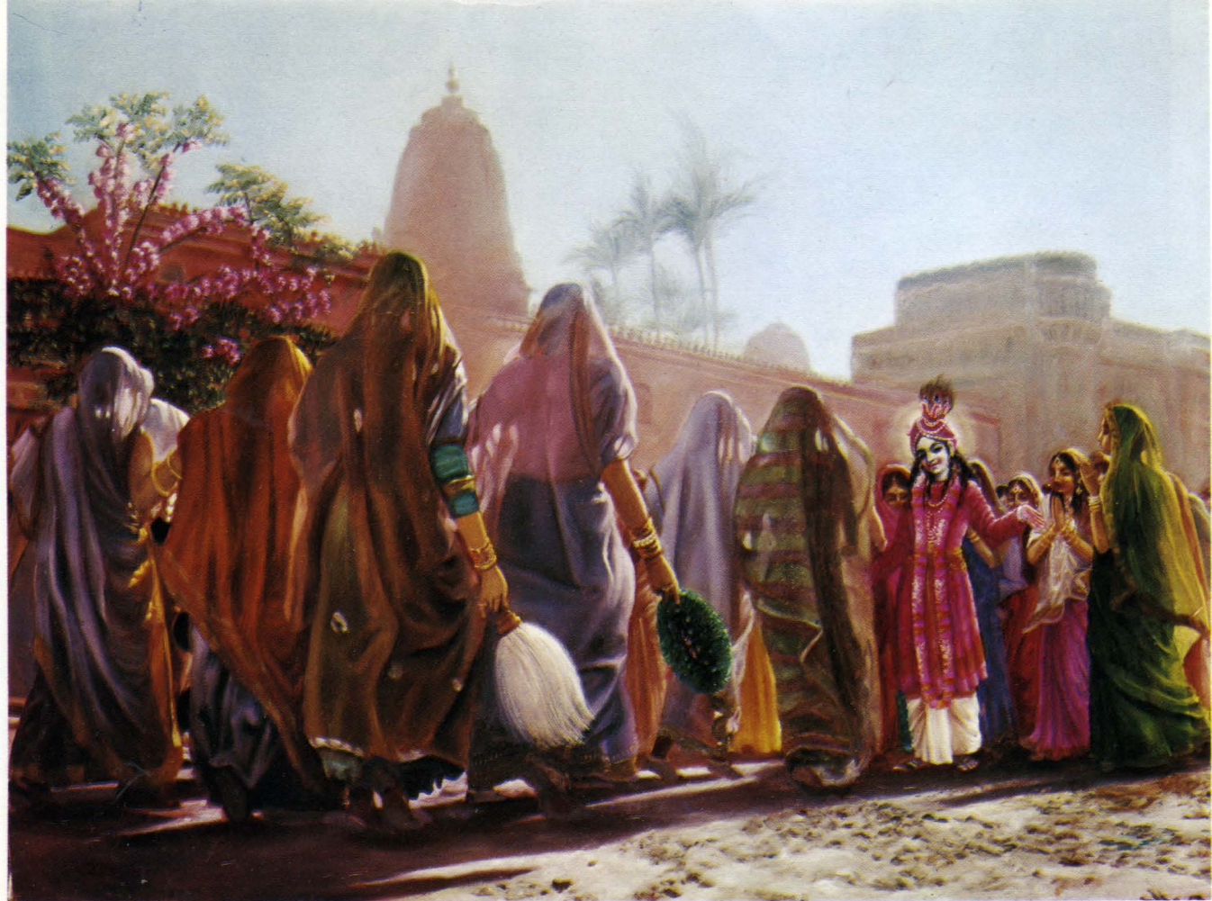
Plate 3 The 16,000 princesses all looked upon Lord Kṛṣṇa with eagerness, joy and shyness and offered to be His wives. (p. 97)