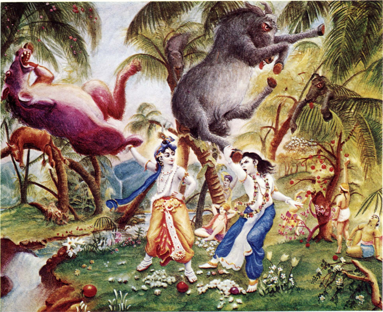
Plate 2 While playing like small children, Kṛṣṇa and Balarāma killed Dhenukāśura and the other ass demons. (p. 86)