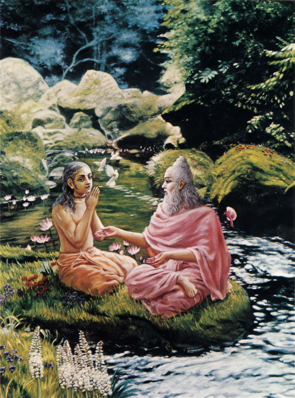
Plate 6 Seated at the mouth of the celestial Ganges River, Vidura inquired from the great learned sage Maitreya. (p. 159)