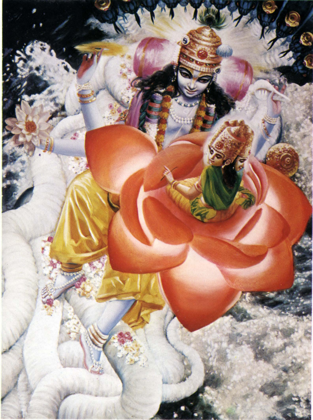
Plate 7 Lord Brahmā could see the Personality of Godhead lying on the lotuslike white bedstead, the body of Śeṣanāga. (p. 322)