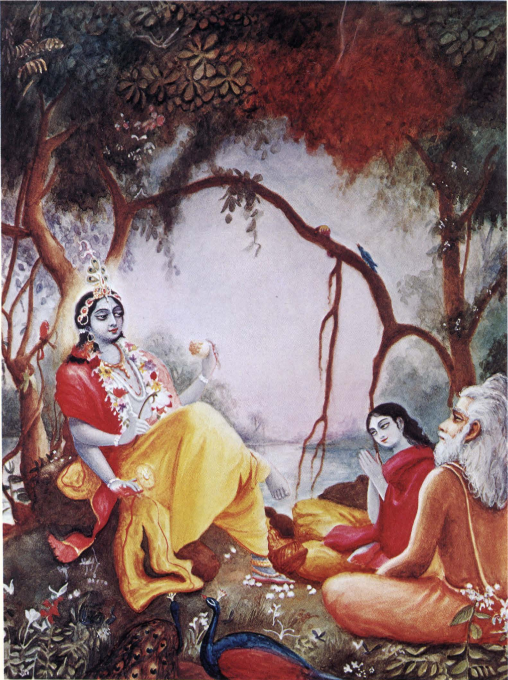
Plate 5 "Because of your pure and unflinching devotional service, your visit to Me in this lonely place is a great boon for you." (p. 129)