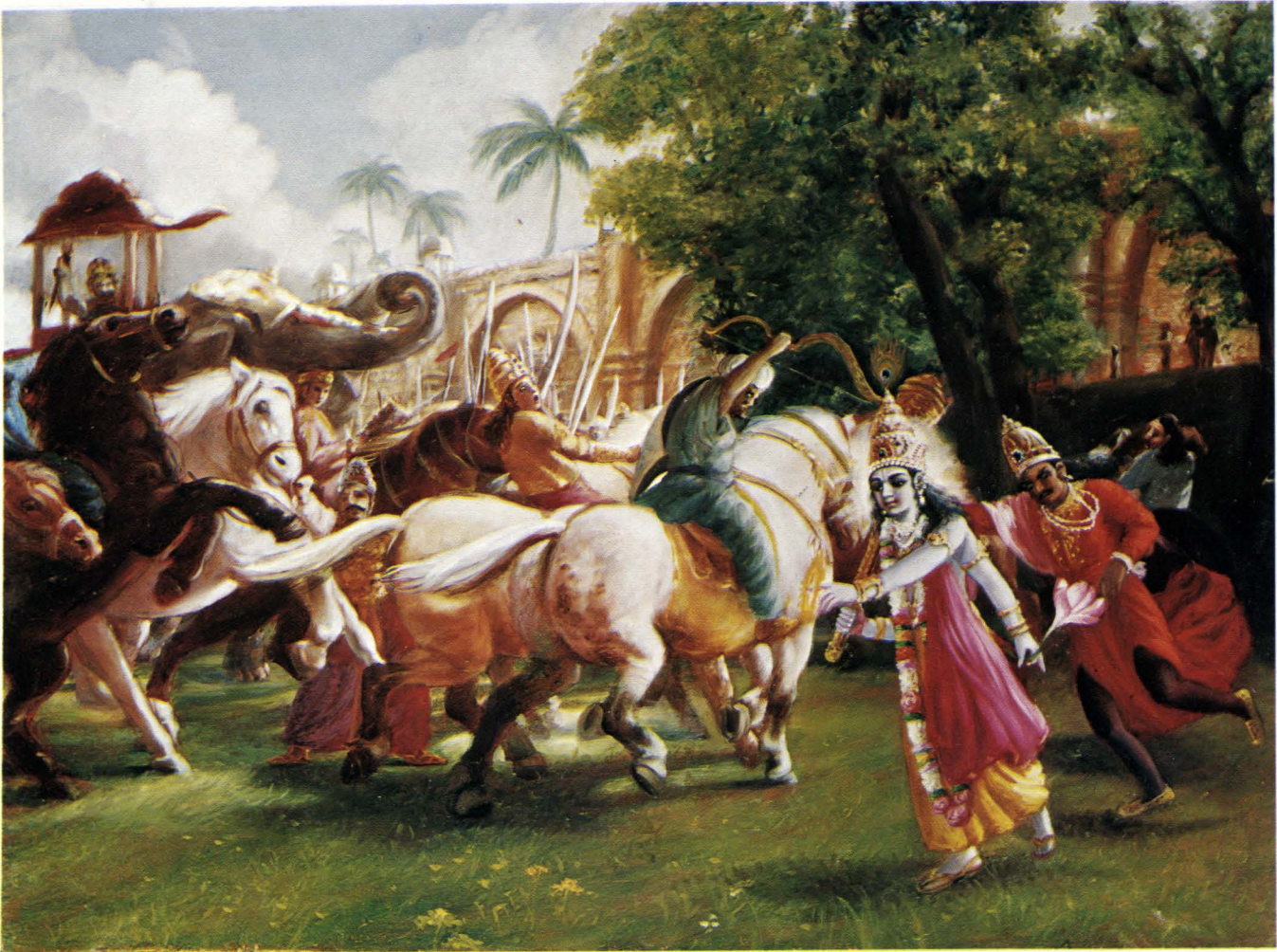
Plate 4 Kṛṣṇa is known as Ranchor, or one who fled from fighting. (p. 100)