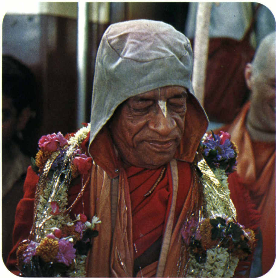
His Divine Grace A.C. Bhaktivedanta Swami Prabhupāda