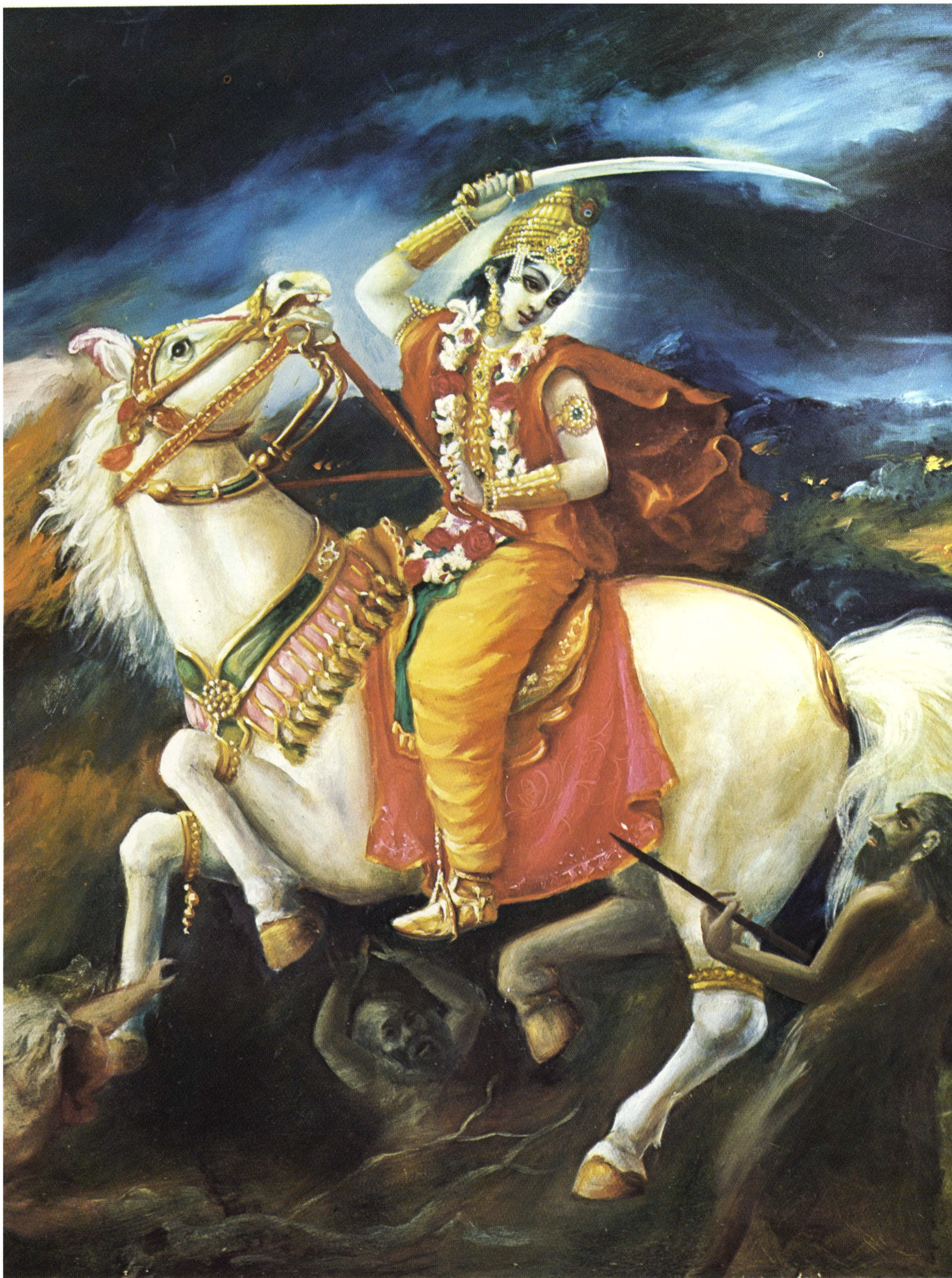
Plate 12 At the end of Kali-yuga the Lord appeared as the supreme chastiser. (p. 397)