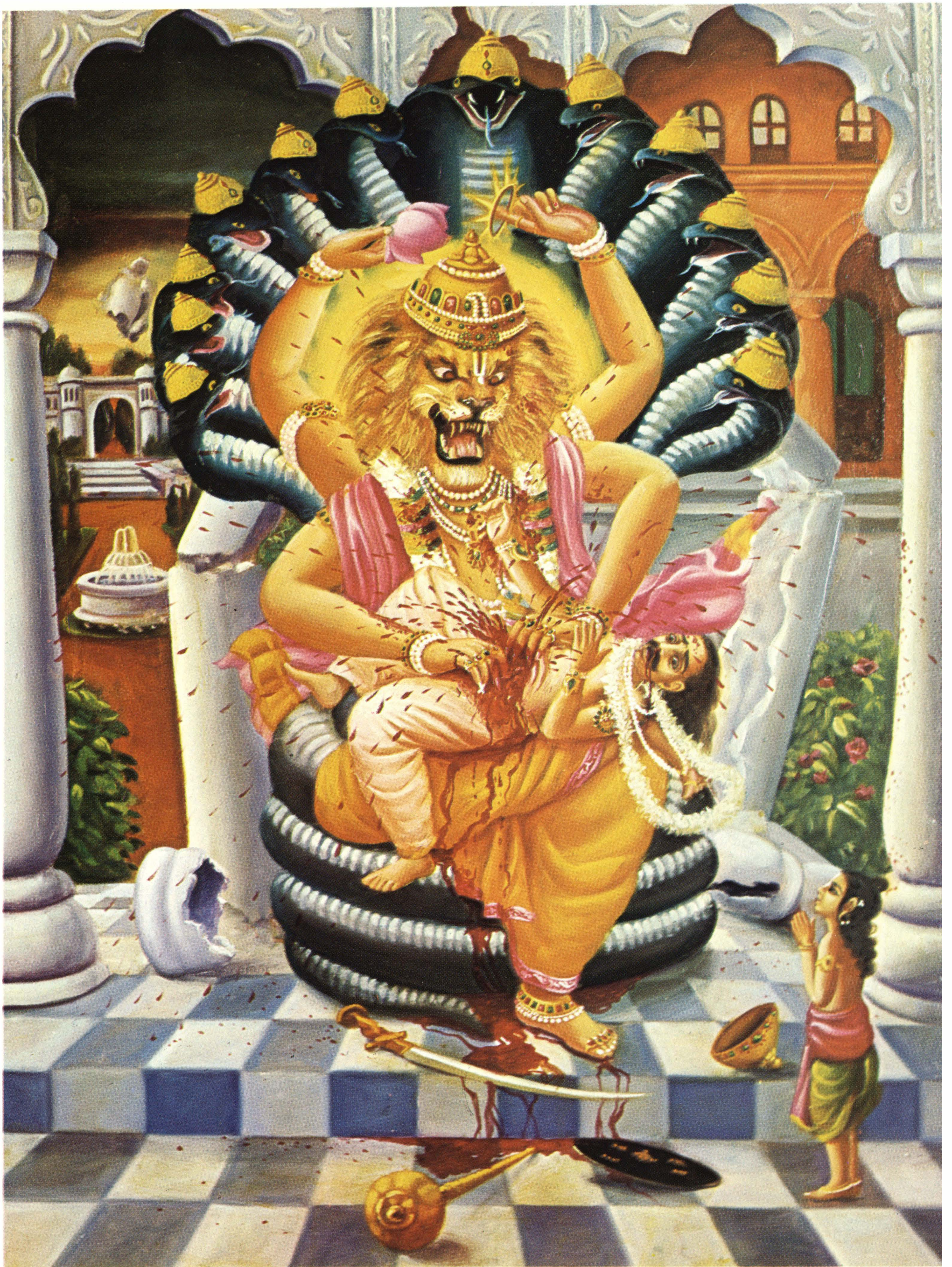
Plate 4 The Personality of Godhead Narasimhadeva killed the demon Hiranyakaśipu by piercing him with His nails. (p. 359)