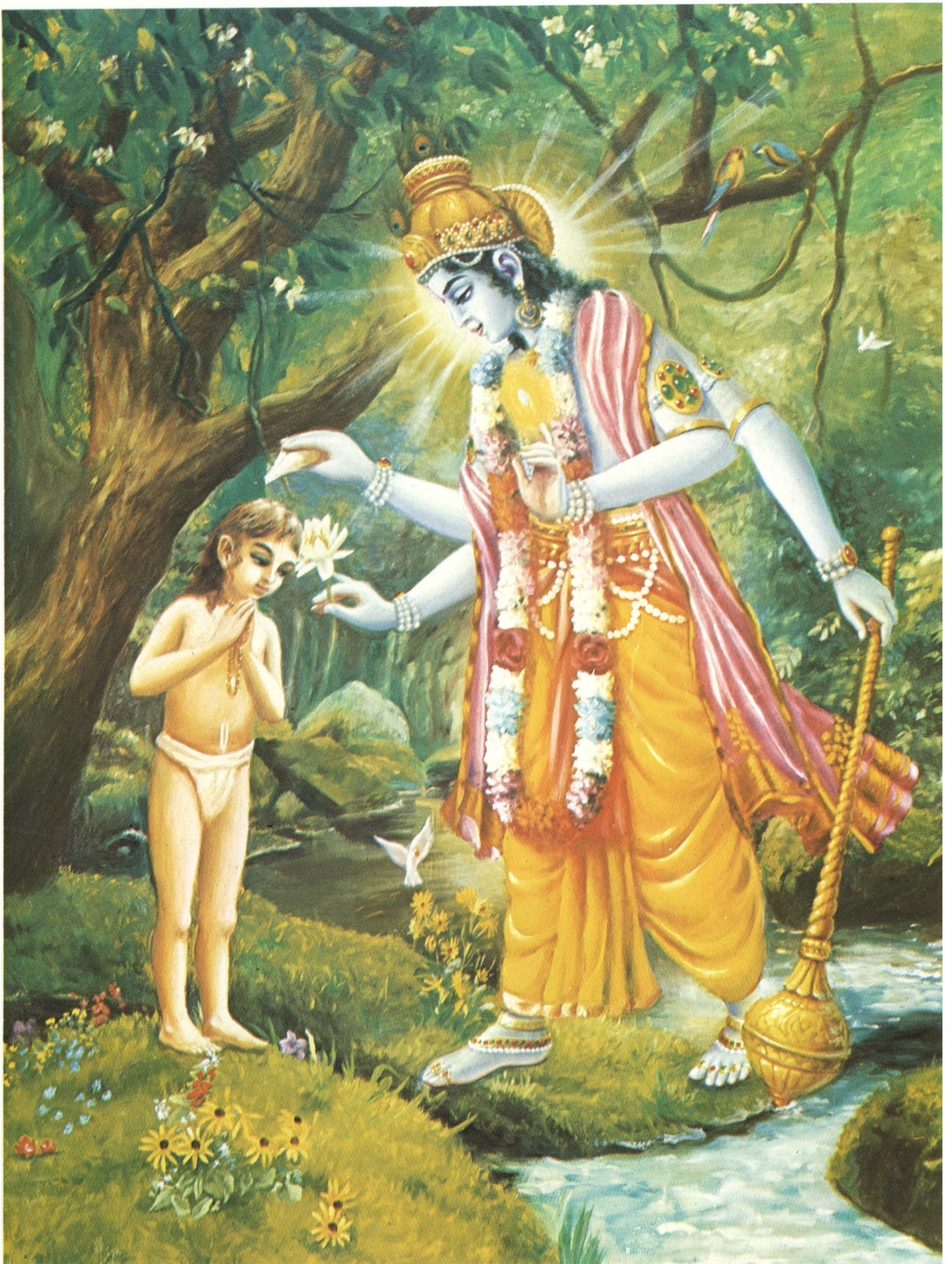
Plate 2 Dhruva Mahārāja is benedicted by the Personality of Godhead. (p. 350)