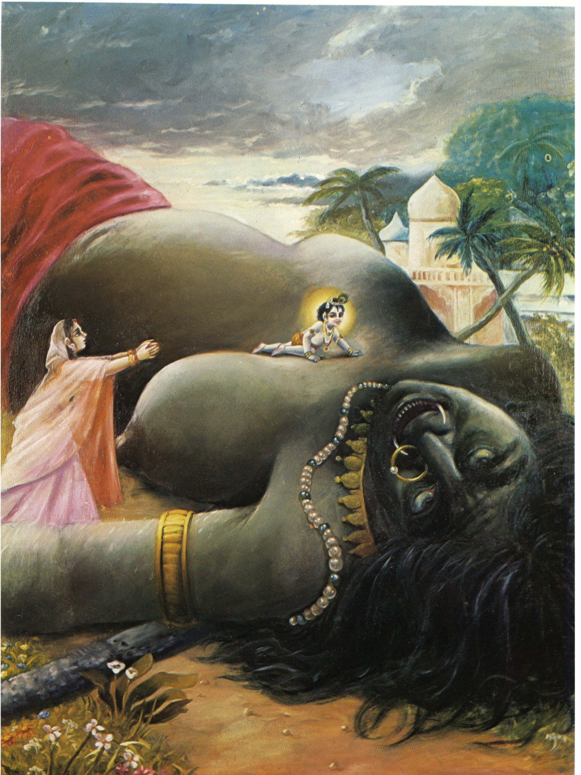
Plate 9 The Lord sucked the breast of the Pūtanā witch along with her life air, and the demon's gigantic body fell down. (p. 383)