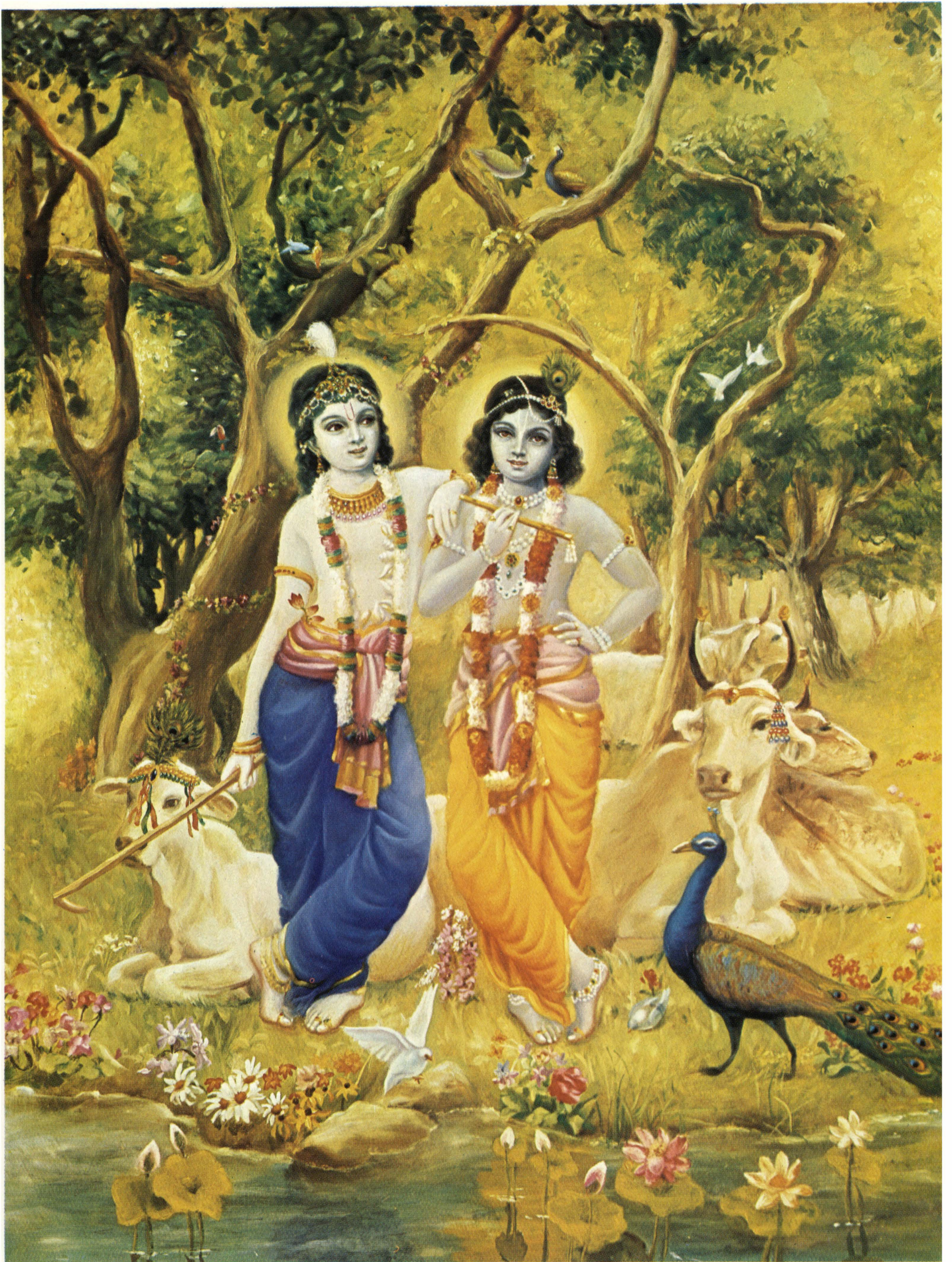
Plate 8 In order to diminish the burden of the world, Lord Kṛṣṇa appeared with His immediate expansion Lord Balarāma. (p. 381)