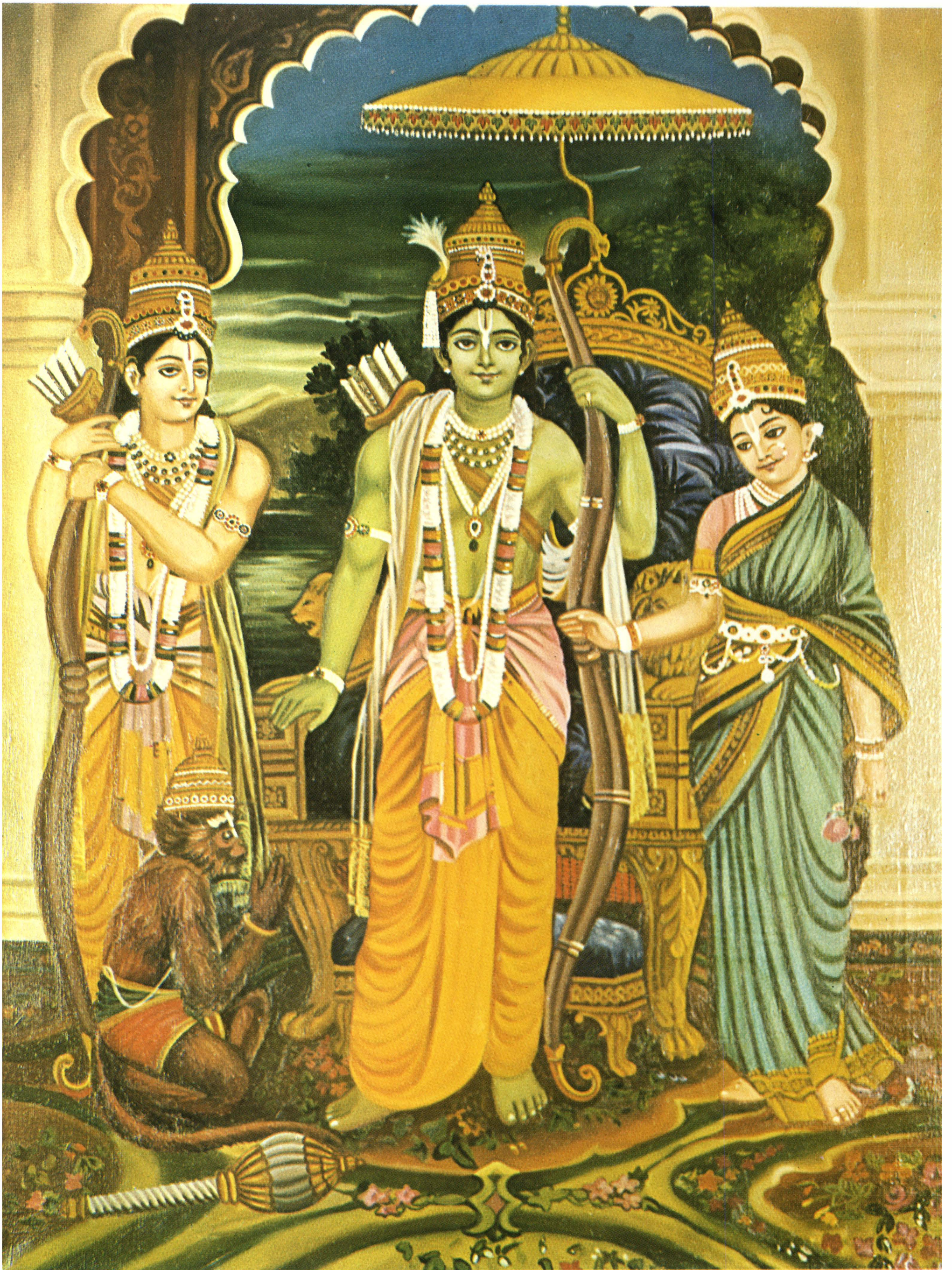
Plate 7 Lord Rāmacandra appeared along with His eternal consort Sītā, brother Lakṣmana and servant Hanumān. (p. 375)