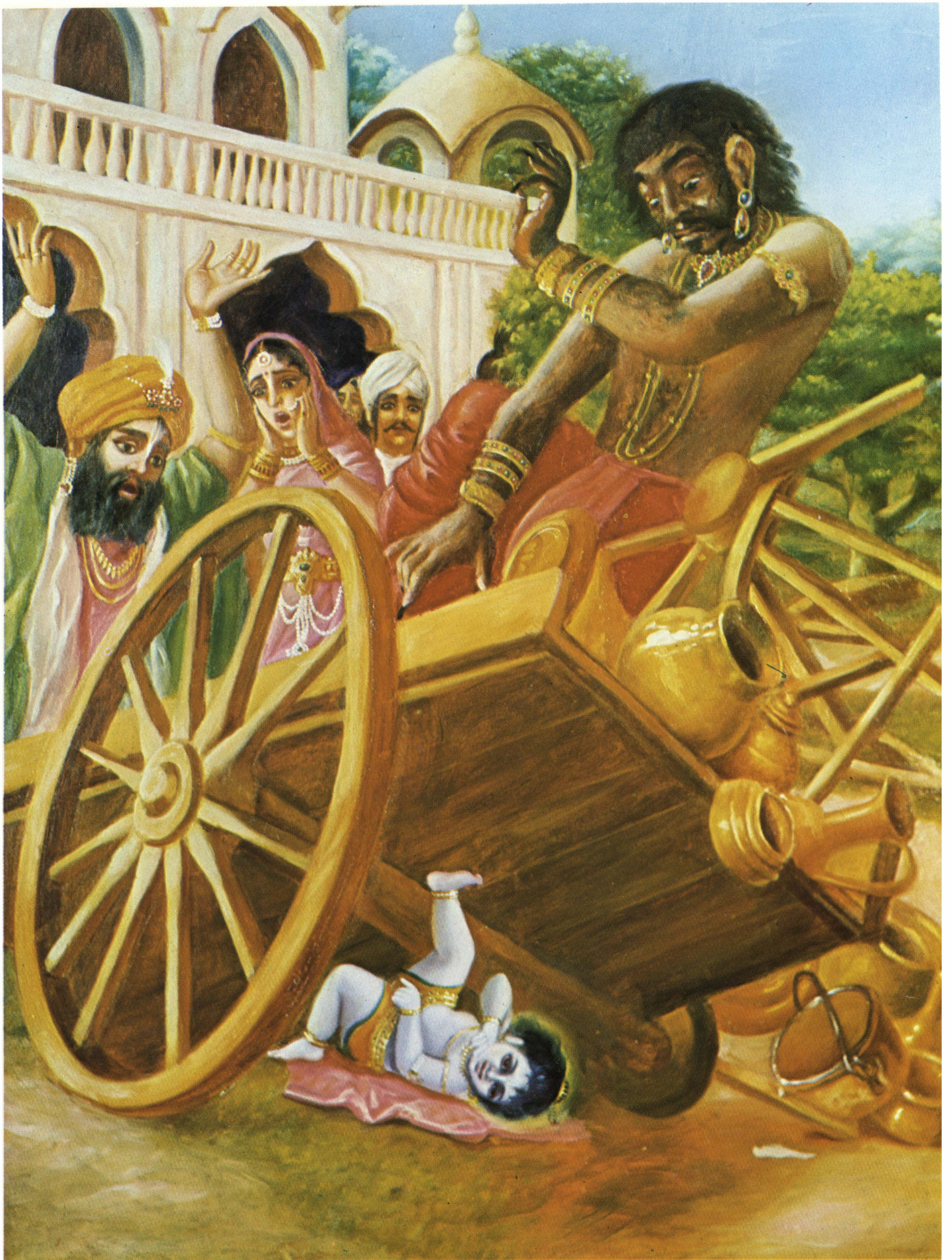
Plate 10 At the age of three months, Lord Kṛṣṇa killed the Sakatāsura demon, who had remained hidden behind a cart. (p. 383)