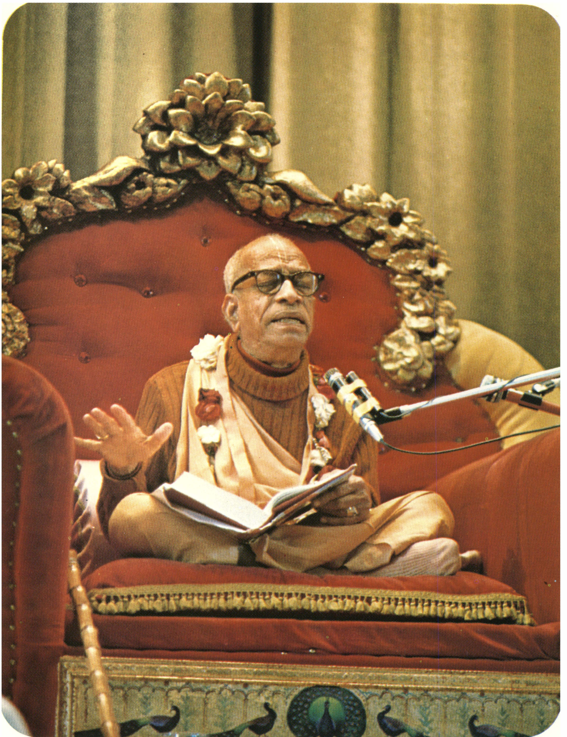
His Divine Grace A.C. Bhaktivedanta Swami Prabhupāda