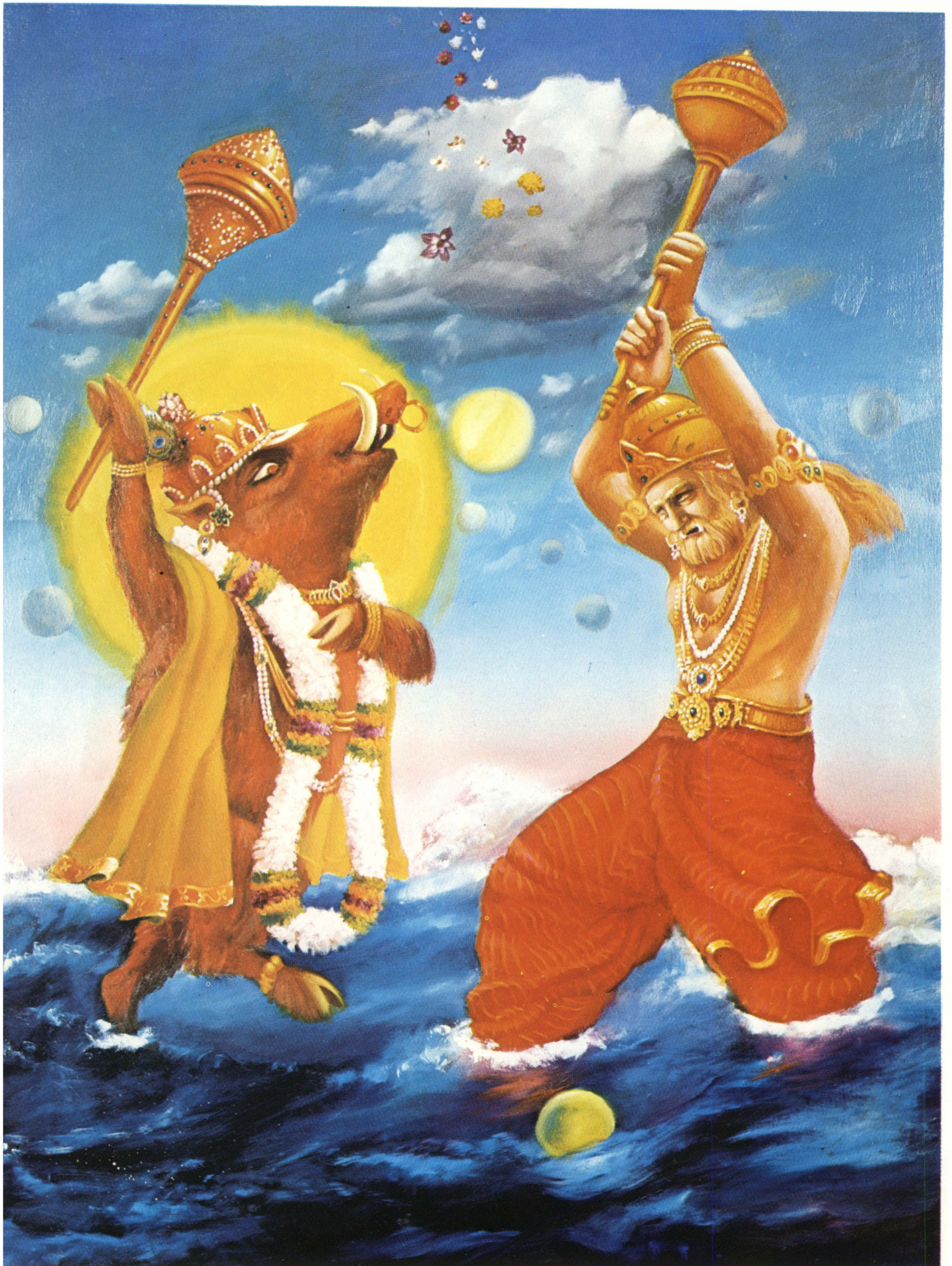
Plate 1 The Lord assumed the gigantic form of a boar and fought with the demon Hiraṇyākṣa. (p. 338)