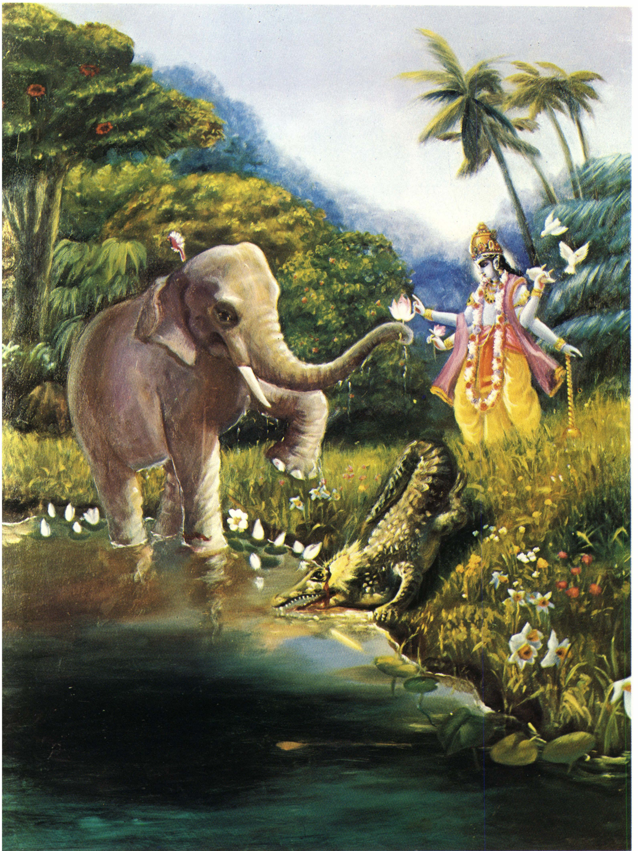
Plate 5 After hearing the elephant's plea, the Lord cut the mouth of the crocodile to save the elephant. (p. 364)