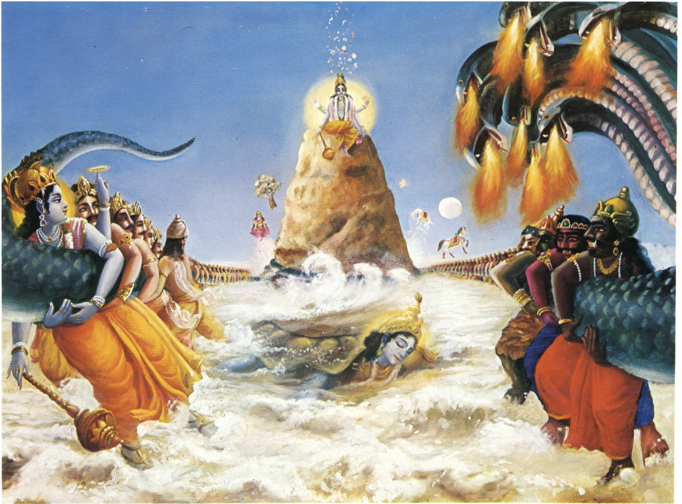
Plate 3 To help the demigods, the primeval Lord assumed the incarnation of a gigantic tortoise, swimming in the ocean of milk. (p. 358)